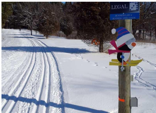
Put on a holiday cap (or cape) for the Dec. 4 Nordic Ski Club holiday soup and costume party

Covid-19 Policies for NSCM Bus Trips, Events, Meetings